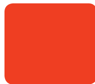
Red 320 S

Other dimensions: 1,000sqm, W+4 (except for 2,000mm wide, please consult us) *According to palletising