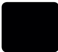
Black 905 S