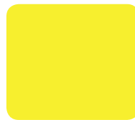
Yellow 123 S