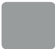
Silver 906 S