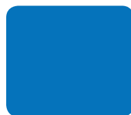
Blue 502 S