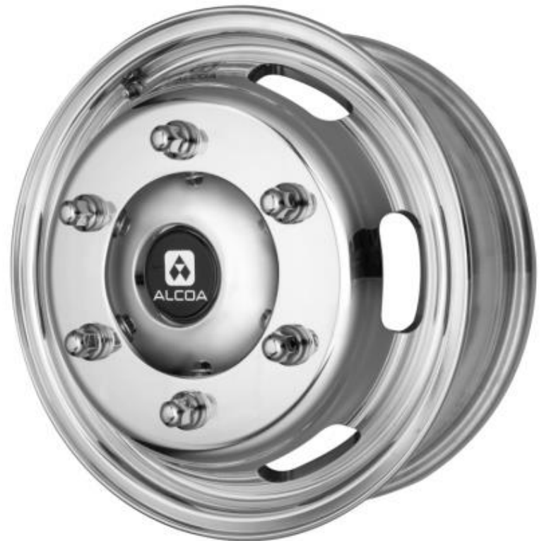
25180x Sprinter 3500

Get the finest durability, quality, and style combined with specialty finish options for your Sprinter vehicle today!