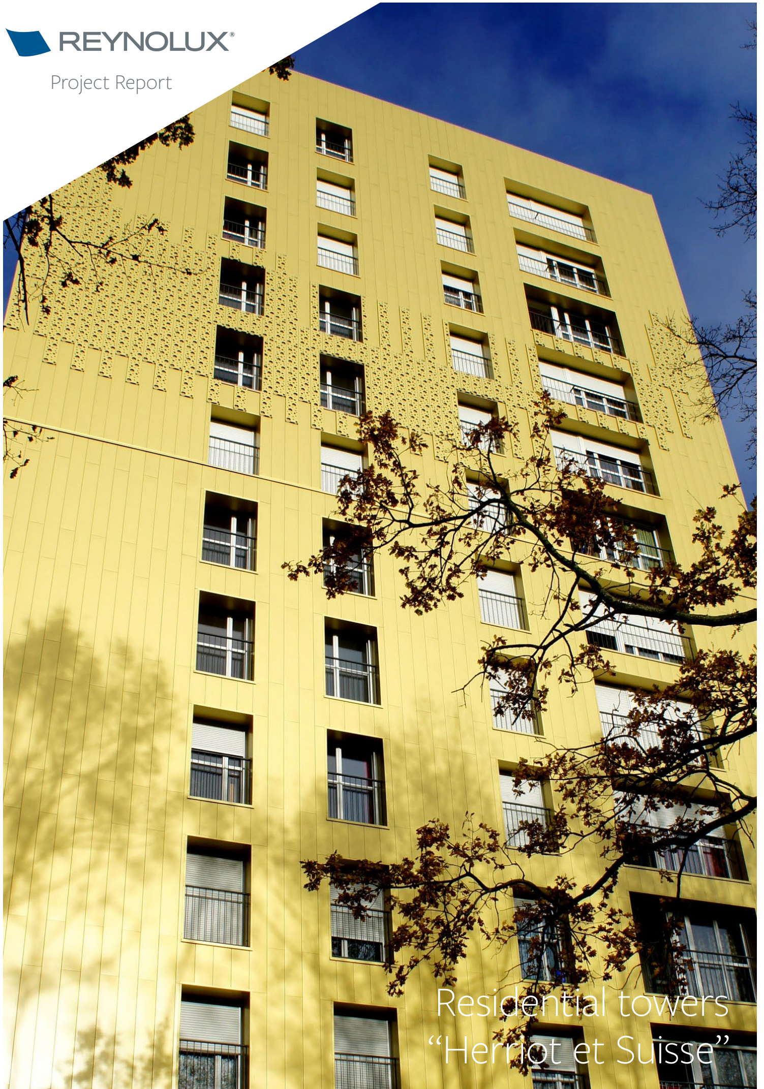
Residential towers “Herriot et Suisse”